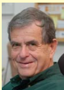
Prof. Aaron Ciechanover

Dr. Francis Gurry, Director General of the UN's World Intellectual Property Organization (WIPO), has made a great contribution to the advancement of Israel as a leader in the area of intellectual property and to targeting intellectual property as a significant component of science and research. He has strong ties with the University of Haifa, helping place it in the forefront of intellectual property research.